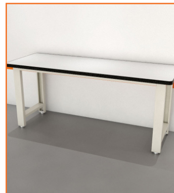
2.1 METER WORKBENCH