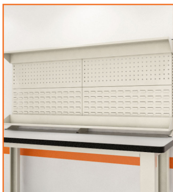
1.8 METER BACKBOARD