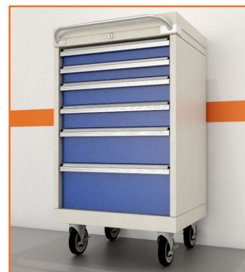
6 DRAWER CABINET ON WHEELS