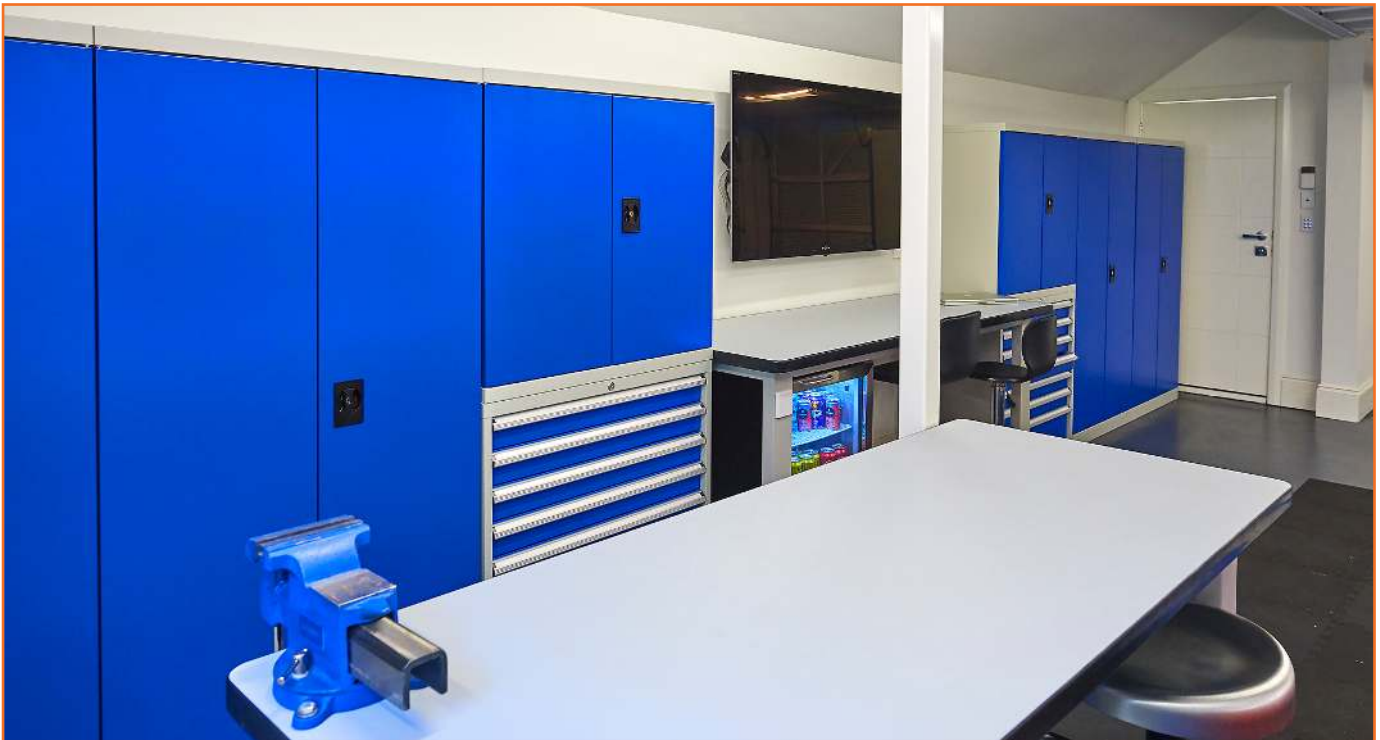
Vice mounted to heavy duty workbench