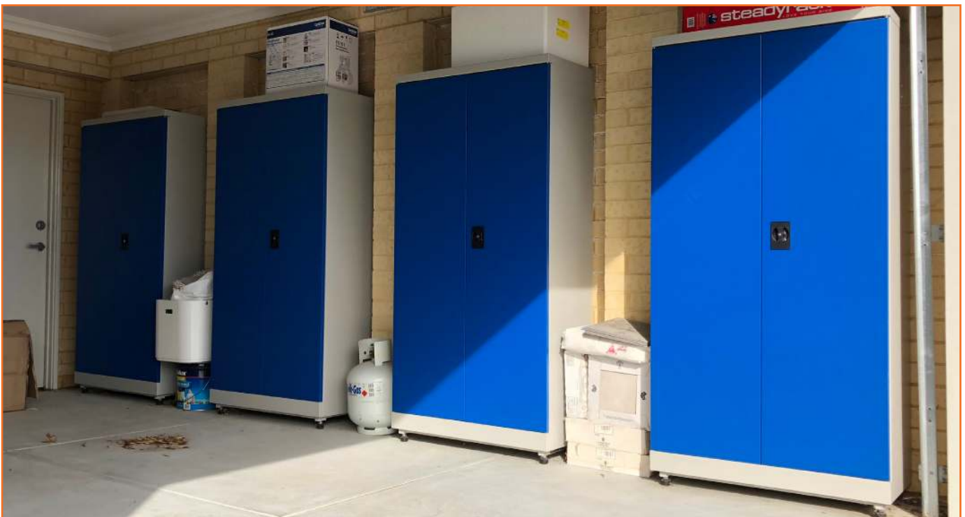
Large cabinets on adjustable base neatly set into garage recesses