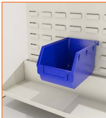
STORAGE BIN 200MM