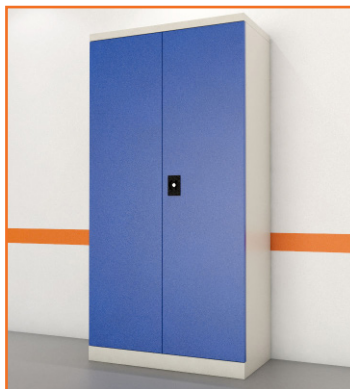
2 DOOR CABINET LARGE

900mm (w) 1800mm (h) 450mm (d) 4 Adjustable Shelves