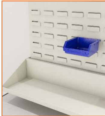
STORAGE BIN 100MM