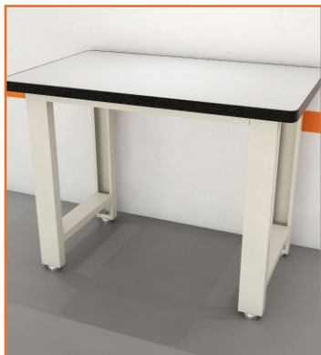
1.2 METER WORKBENCH