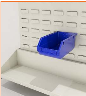
STORAGE BIN 180MM