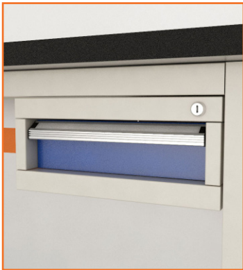
1 DRAWER UNDER WORKBENCH