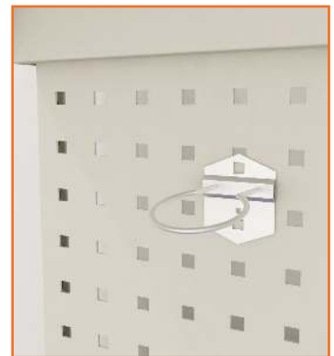
ROUND HOOK 60MM