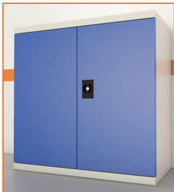
2 DOOR CABINET SMALL

900mm (w) 900mm (h) 450mm (d) 2 Adjustable Shelves