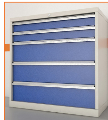
5 DRAWER TOOL CABINET