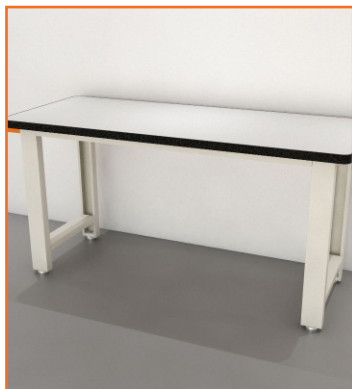
1.8 METER WORKBENCH