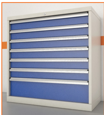
7 DRAWER TOOL CABINET