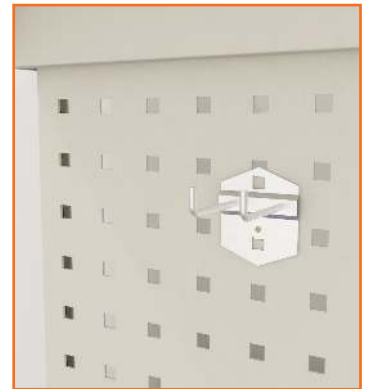
DOUBLE HOOK 50MM