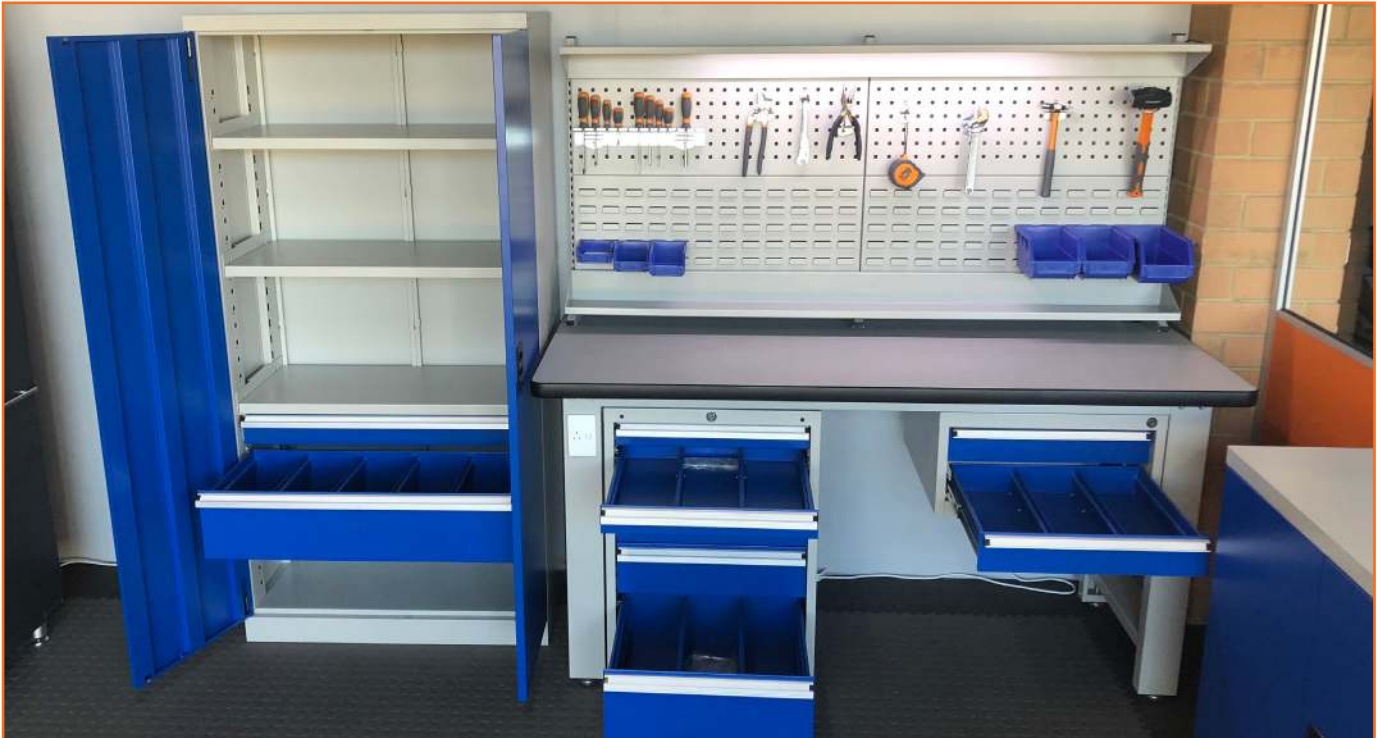
Steel reinforced shelves and drawers for heavy duty weight capacity