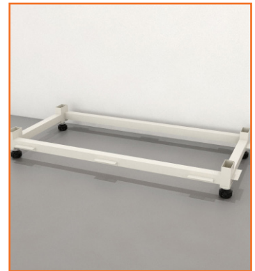
ADJUSTABLE BASE FOR LARGE CABINET