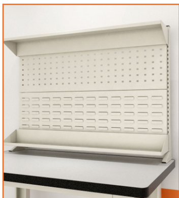
1.2 METER BACKBOARD