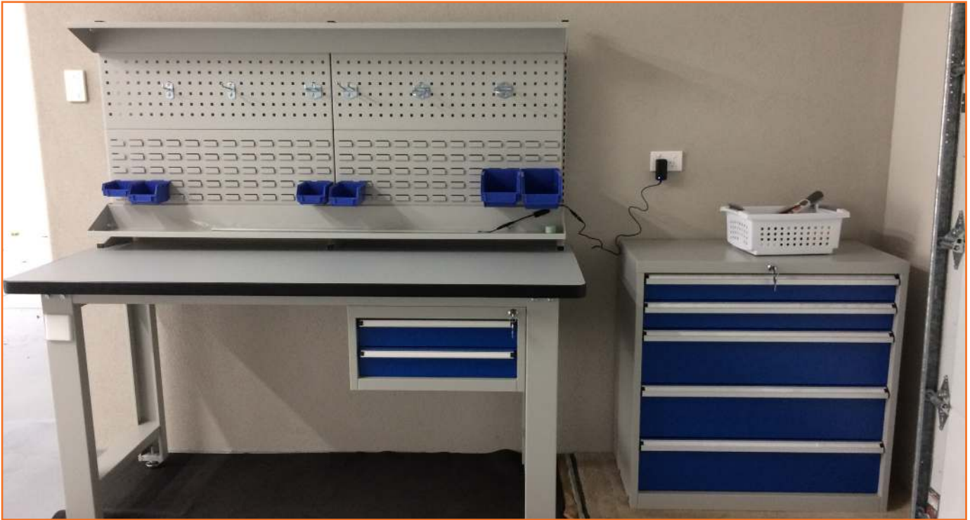
Simple 1.8m Workbench setup with 5 Drawer Tool Cabinet