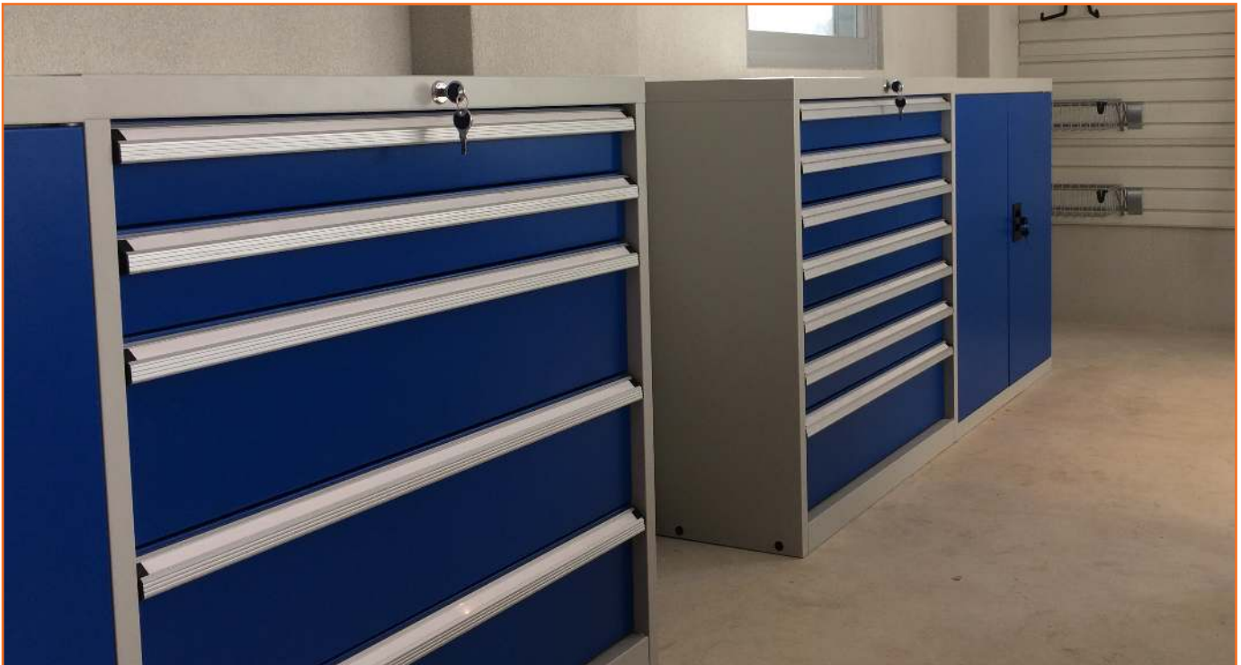
Small enclosed cabinets and drawer cabinets neatly installed below window