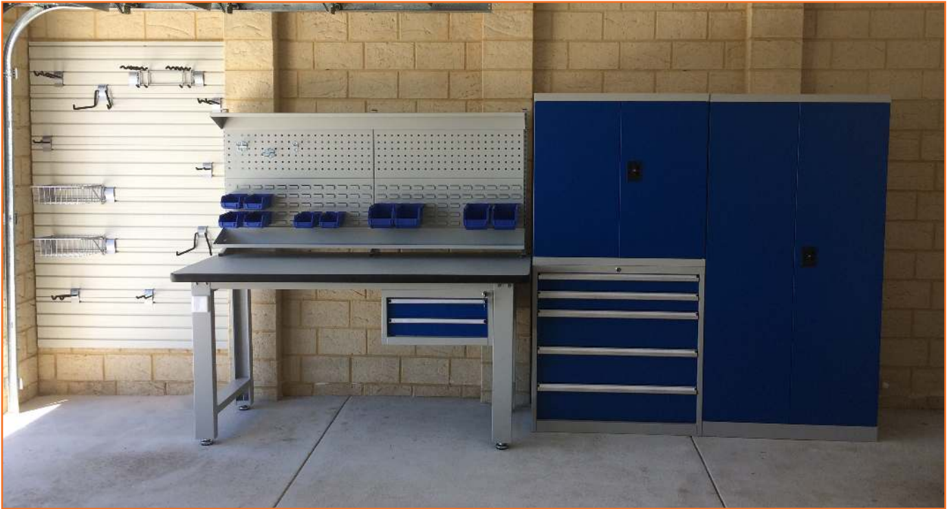
1.8m Workbench with cabinet and tool storage