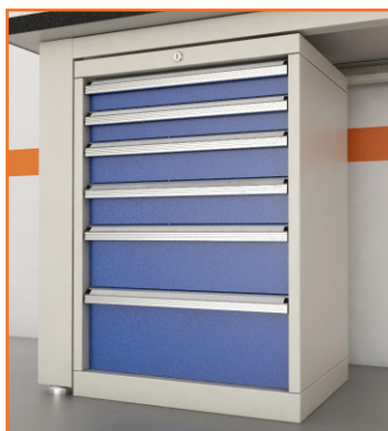
6 DRAWER DESK CABINET