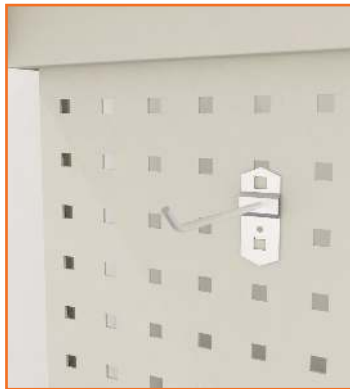
SINGLE HOOK 100MM