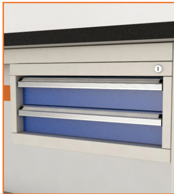
2 DRAWER UNDER WORKBENCH