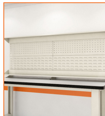
2.1 METER BACKBOARD