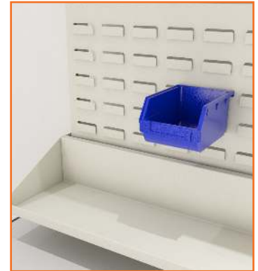
STORAGE BIN 120MM