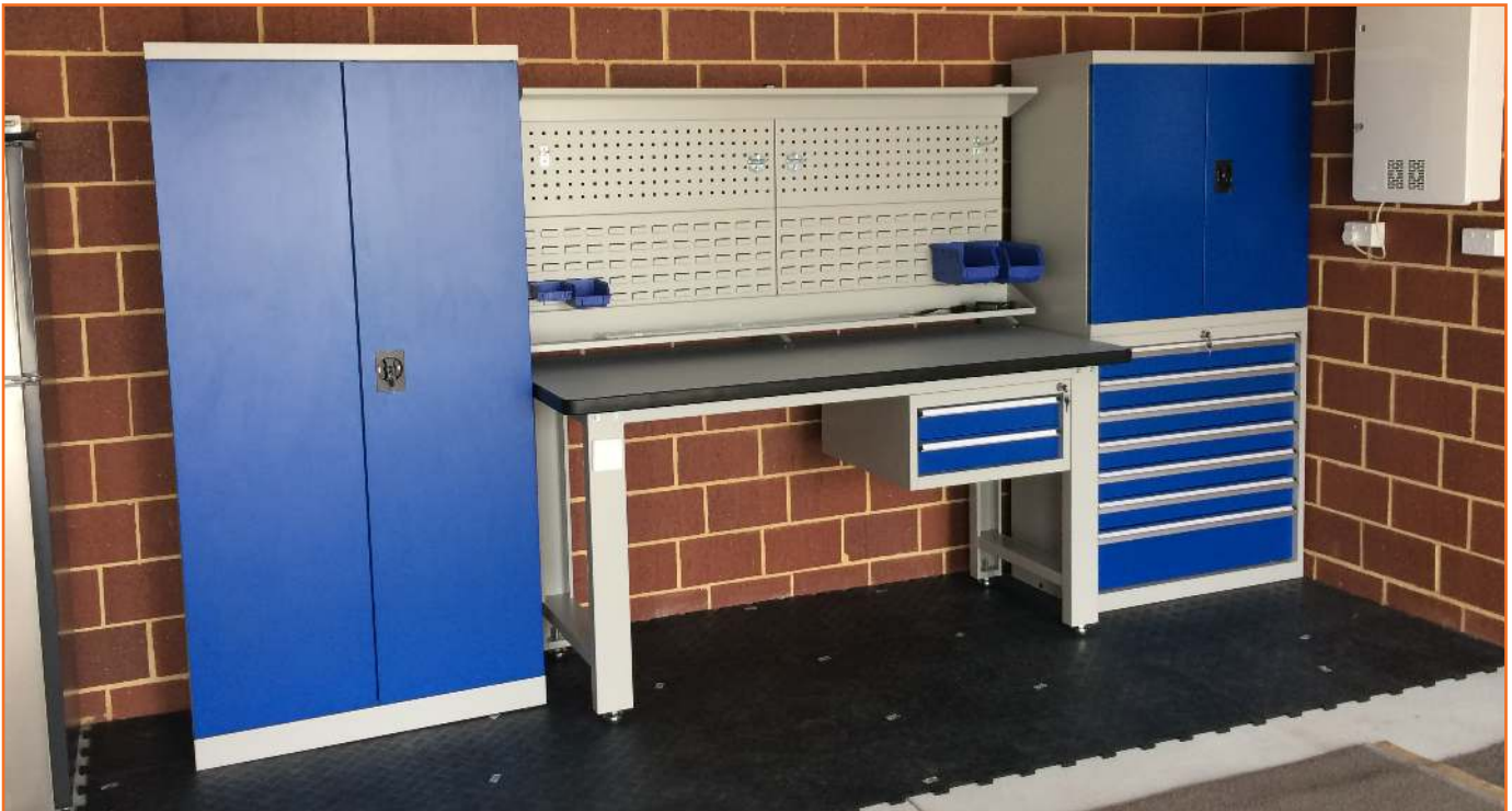
1.8m Workbench framed with tall and half height organising cabinets