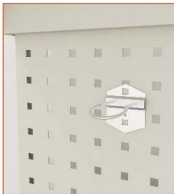
ROUND HOOK 40MM