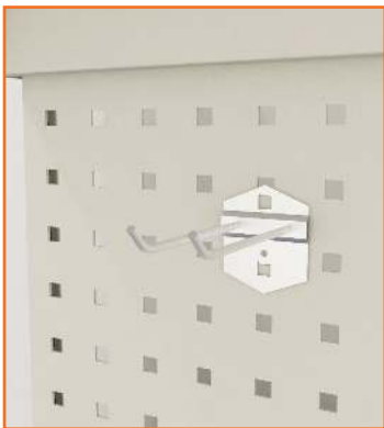
DOUBLE HOOK 100MM