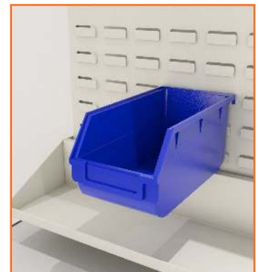
STORAGE BIN 250MM