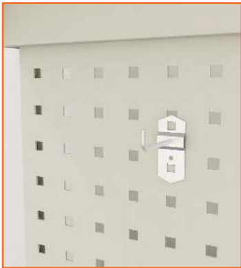
SINGLE HOOK 50MM