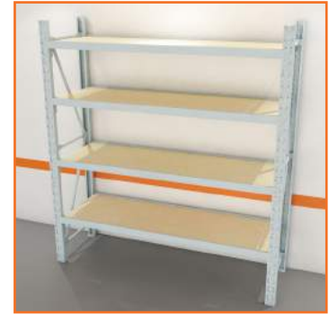
LONGSPAN SHELVING KIT 2.1M HIGH

1960mm (w) 2100mm (h) 600mm (d) 4 Adjustable Shelves