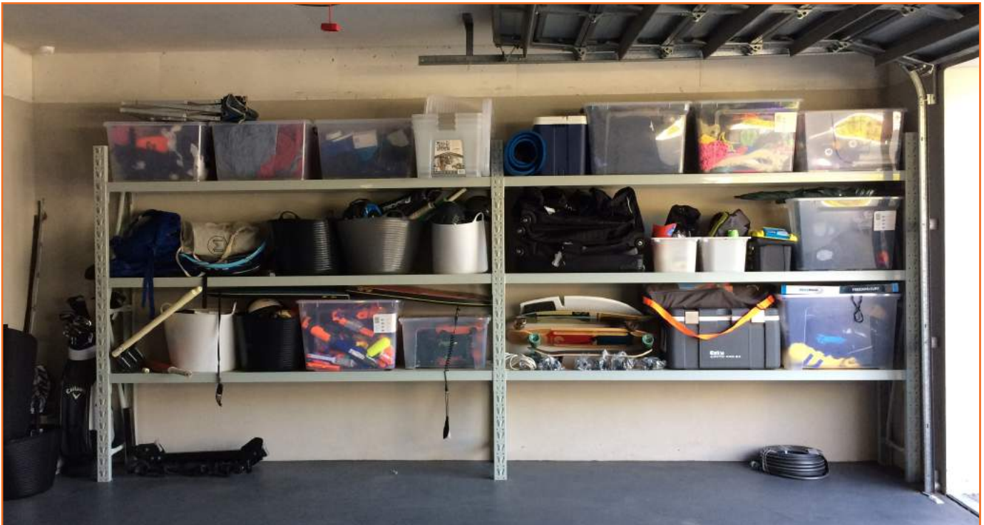
Set shelf height specific for your items to maximise storage space