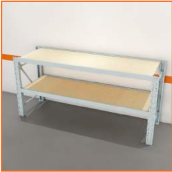
HEAVY DUTY WORKBENCH

1960mm (w) 900mm (h) 600mm (d) 2 Adjustable Shelves