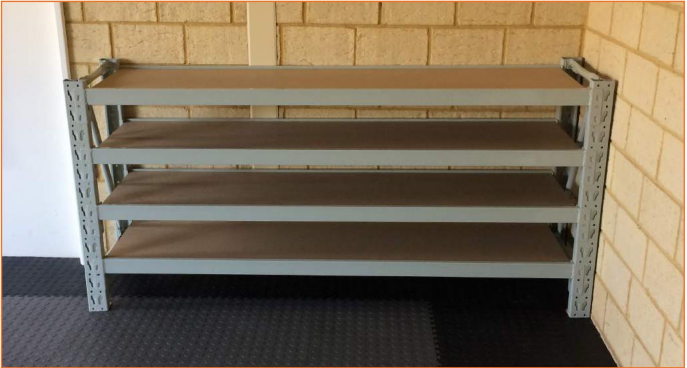
900mm high workbench with 4 adjustable shelves