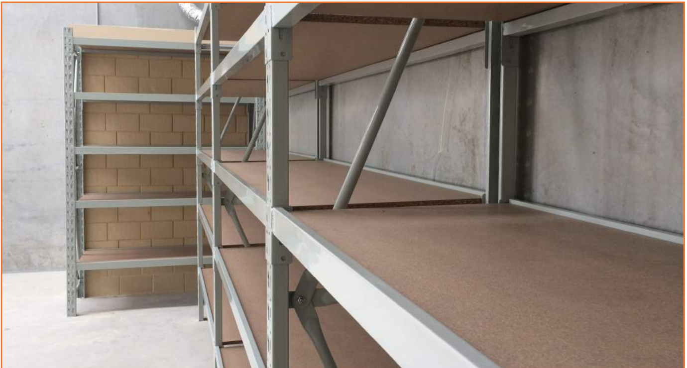
Multiple 2400mm high shelving with 5 adjustable shelves