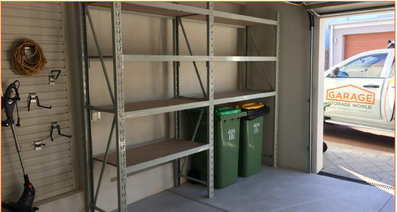
Using an open space can be useful for keeping larger items stored