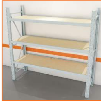
LONGSPAN SHELVING KIT 1.8M HIGH

1960mm (w) 1800mm (h) 600mm (d) 3 Adjustable Shelves