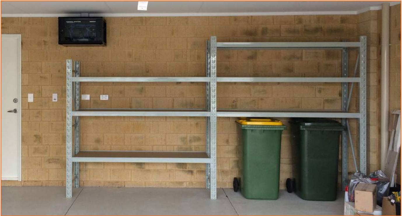
Build a shelving setup to match your space and needs